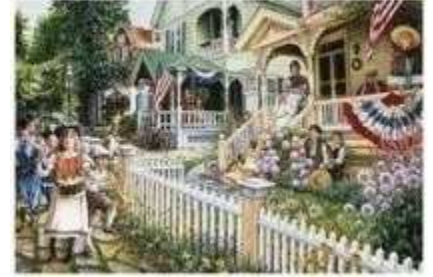
Cape May July 4th

Here's some summertime fun for those rainy days at home, traveling by automobile, or while camping: Put together a jigsaw puzzle. It makes for fun, conversation, and family bonding (our goals at Buzzing Kids World). It's a perfect down-time activity between more strenuous activities while summer vacationing! This puzzle and others are available at www.amazon.com .